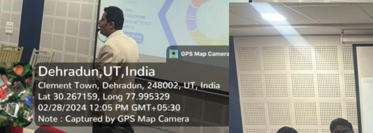
Dehradun, UT, India Clement Town, Dehradun, 248002, UT, India Lat 30.267159, Long 77.995329 02/28/2024 12:05 PM GMT+05:30 Note : Captured by GPS Map Camera