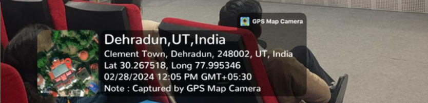
Dehradun, UT, India Clement Town, Dehradun, 248002, UT, India Lat 30.267518, Long 77.995346 02/28/2024 12:05 PM GMT+05:30 Note : Captured by GPS Map Camera